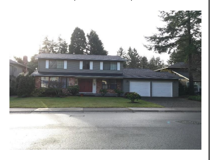
Grade 8/ Year Built 1982/ TLA 2,360