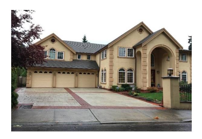
Grade 11/ Year Built 2006/TLA 4,570