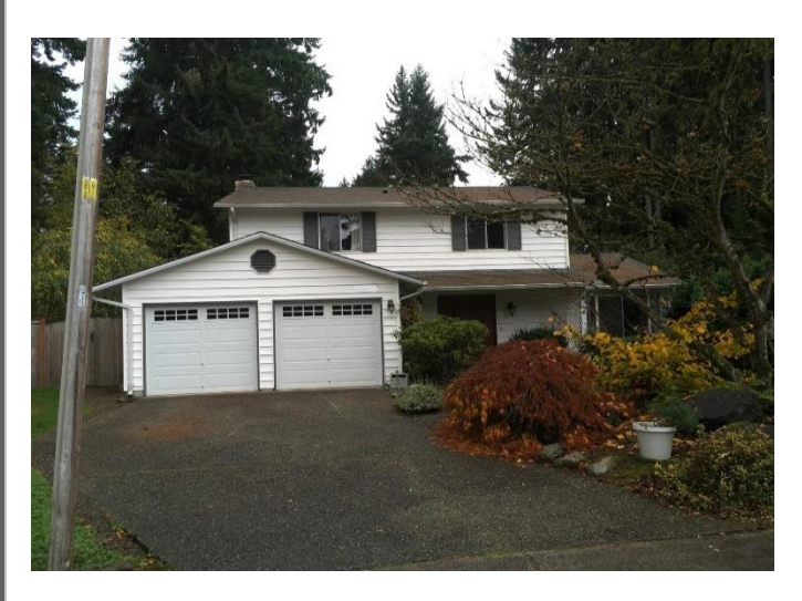
Grade 7/ Year Built 1976/ TLA 1,810