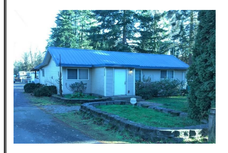
Grade 5/ Year Built 1942/ TLA 1,090