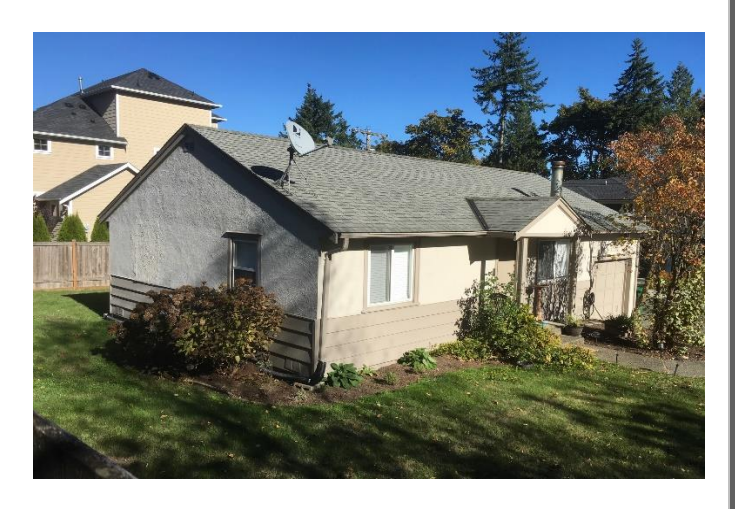
Grade 6/ Year Built 1955/ TLA 950