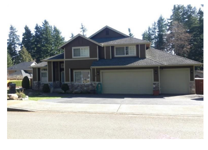
Grade 9/ Year Built 1996/ 2,450