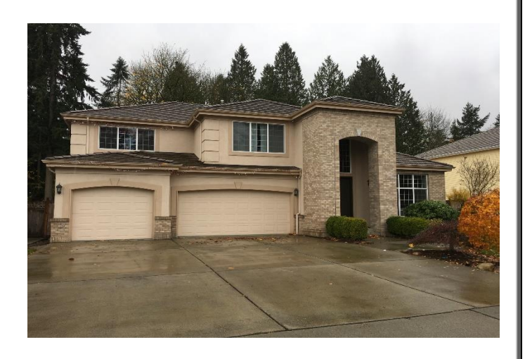
Grade 10/ Year Built 2000/ TLA 3,320