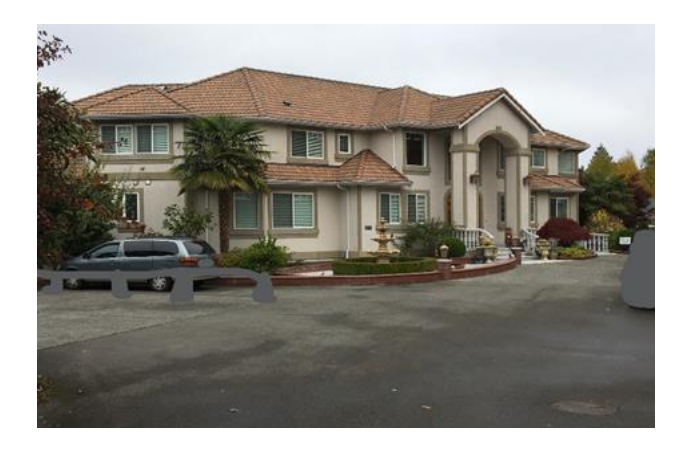
Grade 12/ Year Built 2002/ TLA 7,980