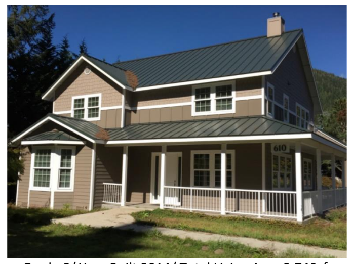
Grade 8/ Year Built 2014/ Total Living Area 2,740sf.