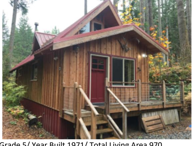
Grade 5/ Year Built 1971/ Total Living Area 970