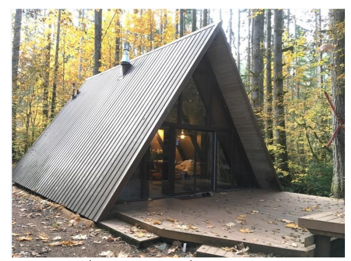
Grade 4 / Year Built 1970/ Total Living Area 660