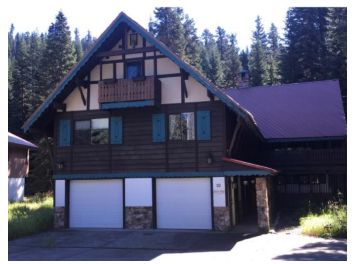
Grade 9/ Year Built 1967/ Total Living Area 4,330sf.