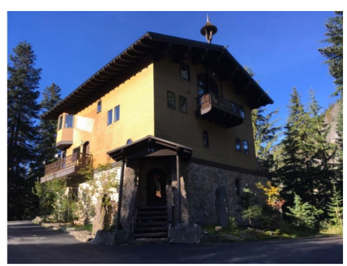
Grade 10/ Year Built 1981/ Total Living Area 3,630sf.