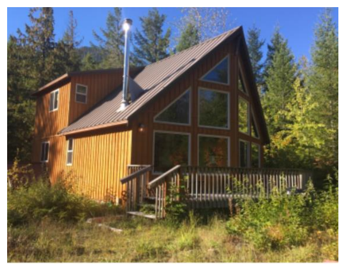
Grade 7/ Year Built 2003/ Total Living Area 1,460sf