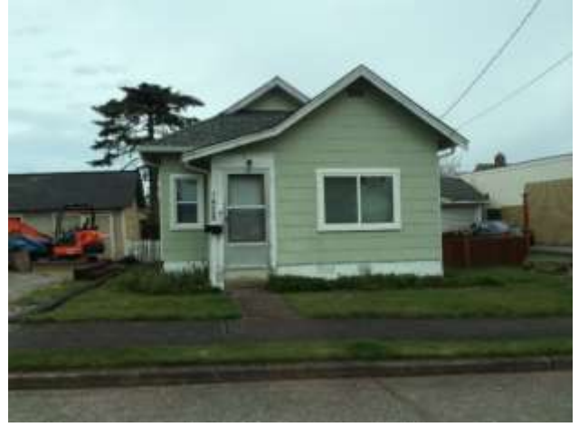
Grade 5/ Year Built 1910/ Total Living Area 780