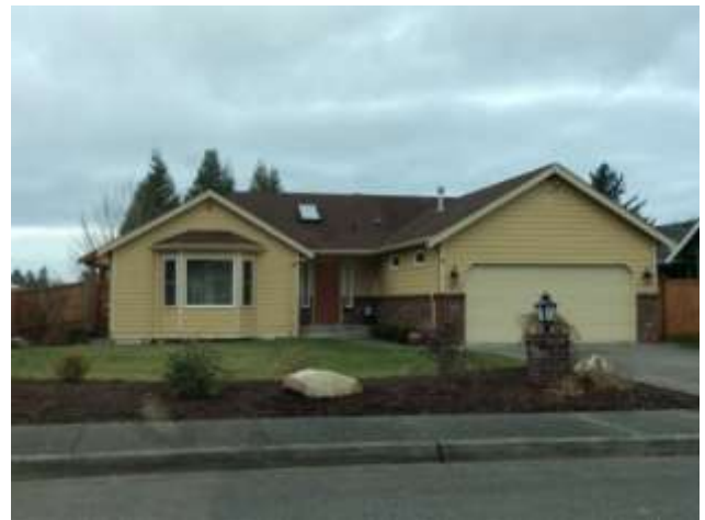
Grade 7/ Year Built 1997/ Total Living Area 1850