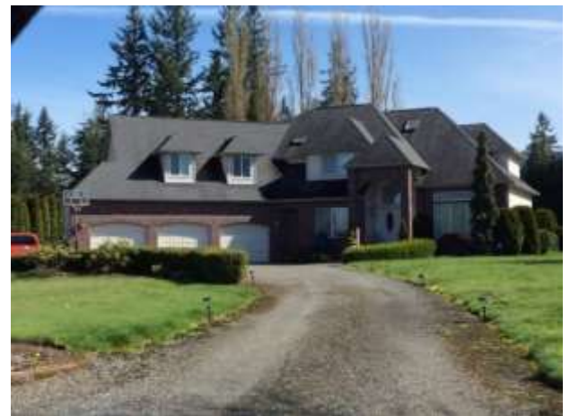
Grade 9/ Year Built 1996/ Total Living Area 3640