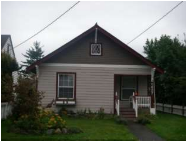
Grade 6/ Year Built 1910/ Total Living Area 960