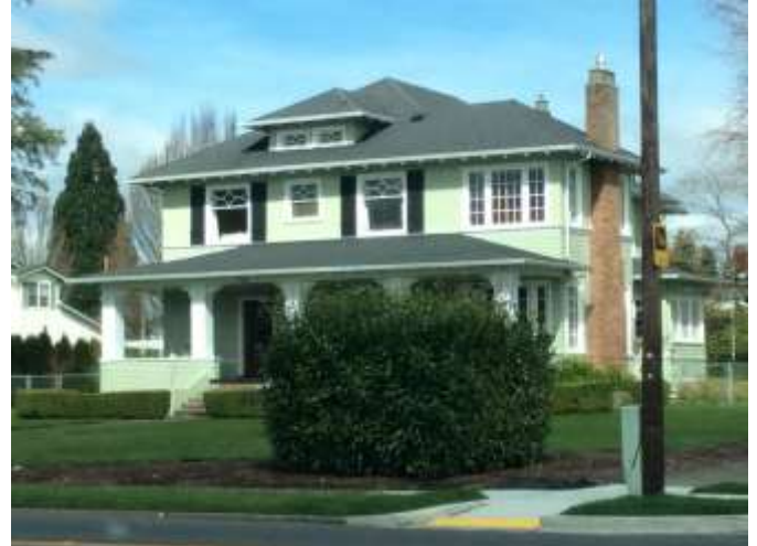
Grade 11/ Year Built 1903/ Total Living Area 6310