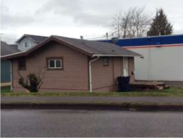
Grade 4/ Year Built 1919/ Total Living Area 480