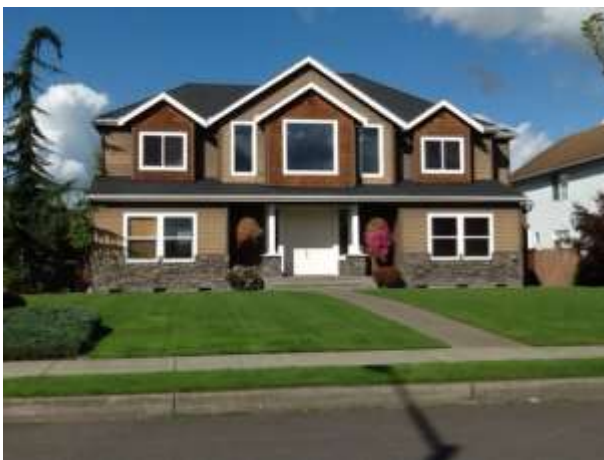
Grade 8/ Year Built 2004/ Total Living Area 2850