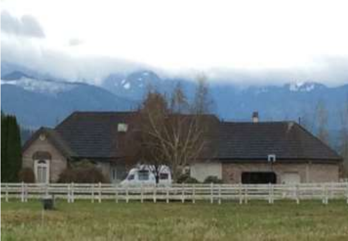
Grade 10/ Year Built 1991/ Total Living Area 3690