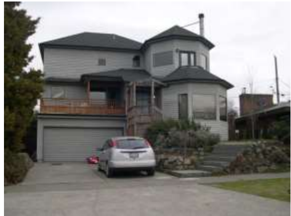
Grade 10/ Year Built 1981/ Total Living Area 2630 Account Number 701520-0125