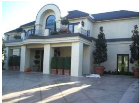
Grade 12/ Year Built 1996/ Total Living Area 9820 Account Number 545730-0950