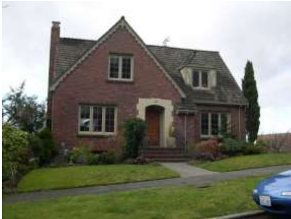
Grade 9/ Year Built 1930/ Total Living Area 2060 Account Number 616990-0535