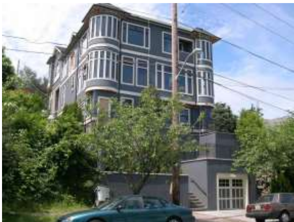
Grade 11/ Year Built 2008/ Total Living Area 7750 Account Number 168940-0075