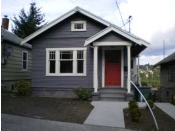
Grade 6/ Year Built 1919/ Total Living Area 580 Account Number 197220-5675