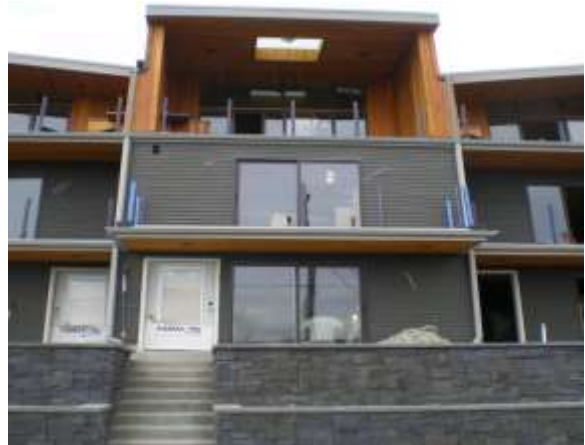
Grade 8/ Year Built 2008/ Total Living Area 1460 Account Number 545830-0720 (Townhouse)