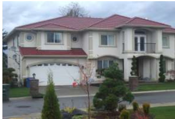
Grade 10/ Year Built 2007/ Total Living Area 3900 Account Number 172205-9335