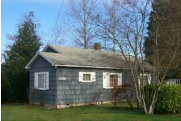
Grade 5/ Year Built 1948/ Total Living Area 880 Account Number 172205-9144