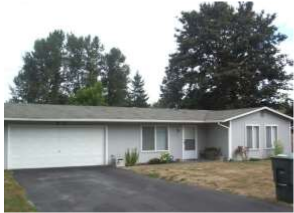
Grade 6/ Year Built 1976/ Total Living Area 1200 Account Number 802570-0370