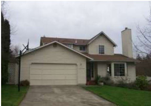
Grade 7/ Year Built 1985/ Total Living Area 1680 Account Number 541980-1170