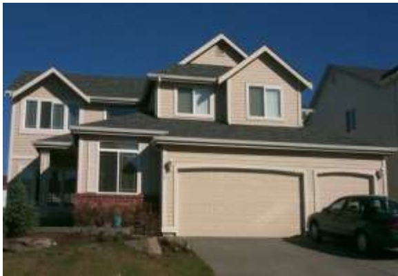
Grade 9/ Year Built 1998/ Total Living Area 3010 Account Number 352840-0120