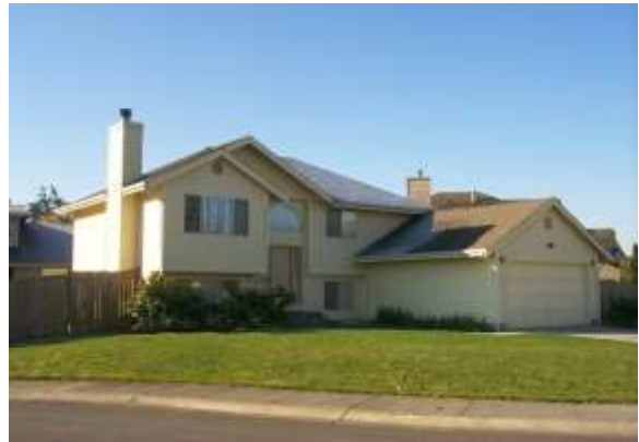
Grade 8/ Year Built 1992/ Total Living Area 2120 Account Number 559170-0340