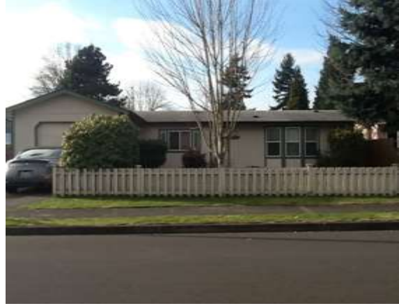
Grade 6/Year Built 1990/Total Living Area 1200 Account Number 000100-0043