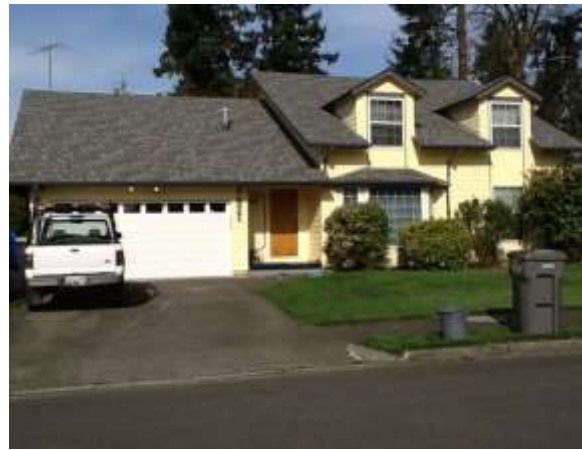
Grade 8/Year Built 1969/Total Living Area 2990 Account Number 774950-0310