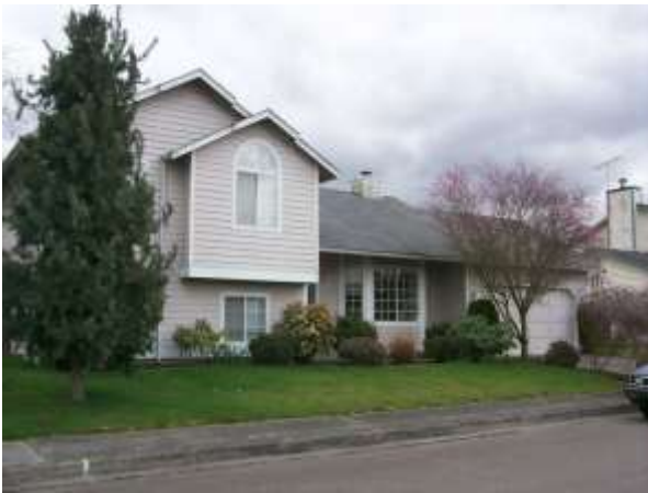
Grade 7/Year Built 1990/Total Living Area 1960 Account Number 519490-0040