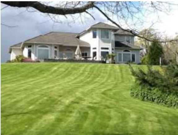
Grade 9/ Year Built 2001/ Total Living Area 3660 Account Number 352105-9117