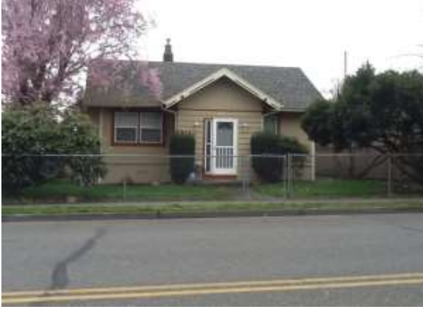
Grade 5/Year Built 1922/Total Living Area 820 Account Number 001600-0010