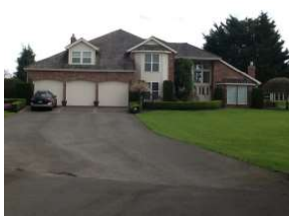
Grade 10/ Year Built 1988/ Total Living Area 3960 Account Number 262105-9067