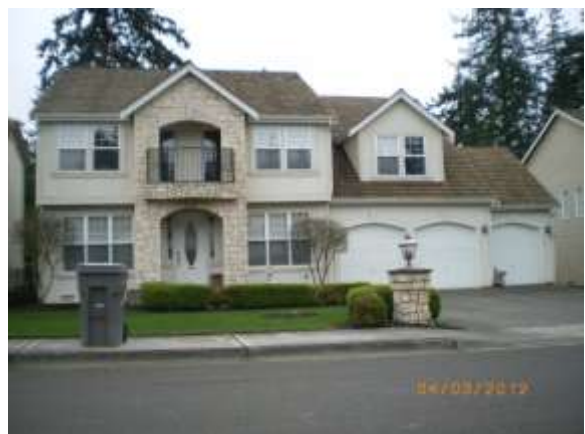
Grade 10/ Year Built 2001/Total Living Area 3270 Account Number 208570-0150