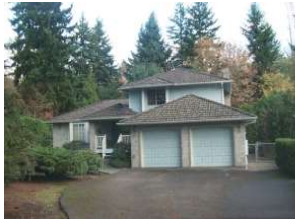
Grade 8/ Year Built 1990/Total Living Area 2180 Account Number 051051-0020