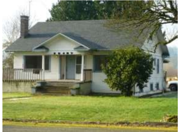
Grade 6/ Year Built 1922/Total Living Area 1410 Account Number 019700-0027