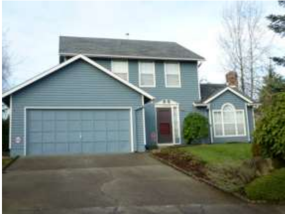
Grade 7/ Year Built 1984/ Total Living Area 1540 Account Number 332951-0280