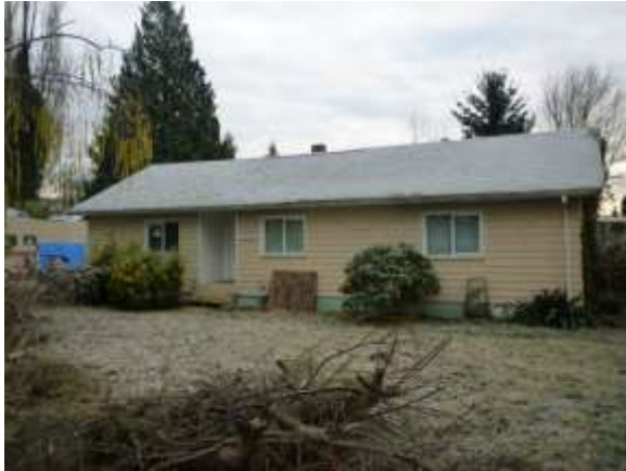
Grade 5/ Year Built 1948/ Total Living Area 880 Account Number 936000-0128