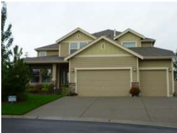
Grade 9/ Year Built 2010/ Total Living Area 2896 Account Number 111560-0110