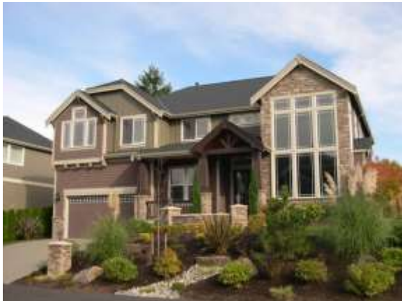
Grade 11/ Year Built 2006/ Total Living Area 3610 Account Number 414552-0020