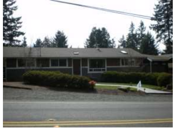
Grade 7/ Year Built 1956/ Total Living Area 1350 Account Number 106660-0070