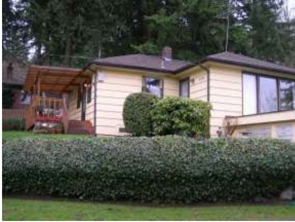
Grade 6/ Year Built 1930/ Total Living Area 970 Account Number 334330-0523