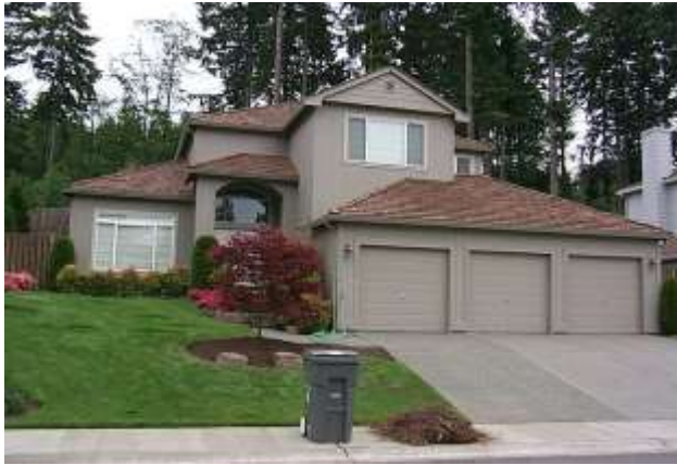
Grade 8/ Year Built 1996/ Total Living Area 2070 Account Number 207850-0170