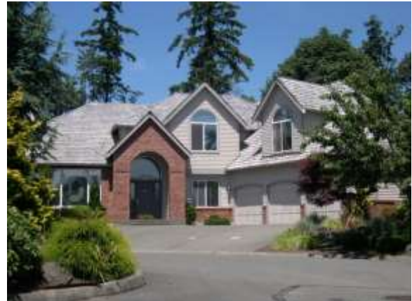
Grade 10/ Year Built 1993/ Total Living Area 3150 Account Number 411380-0520