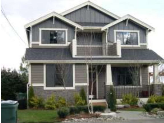
Grade 10/ Year Built 2005/ Total Living Area 3,880 Account Number 881540-0255