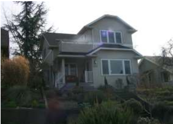
Grade 8/ Year Built 1924/ Total Living Area 2,740 Account Number 882790-1105