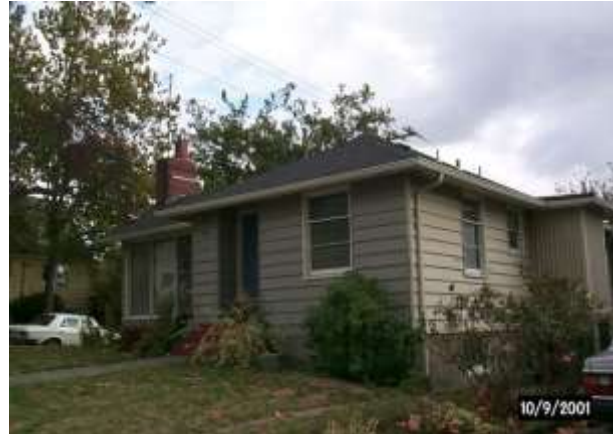
Grade 7/ Year Built 1945/ Total Living Area 1,500 Account Number 237920-0020