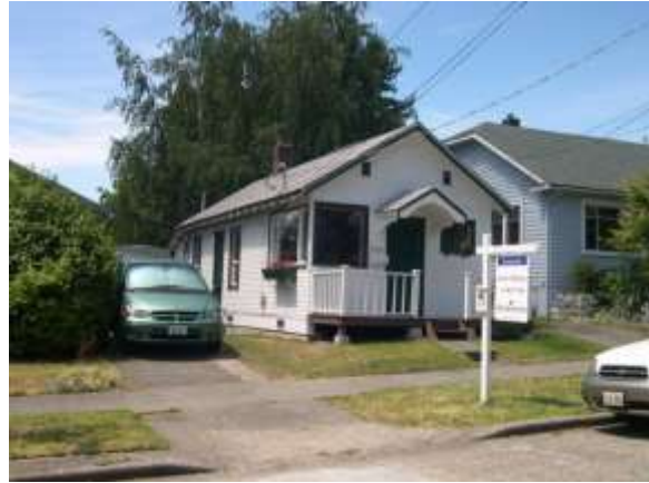
Grade 5/ Year Built 1922/ Total Living Area 530 Account Number 919120-0545