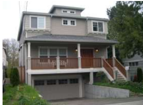
Grade 9/ Year Built 2007/ Total Living Area 3,750 Account Number 243670-0735