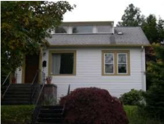
Grade 6/ Year Built 1926/ Total Living Area 1,460 Account Number 243670-0860