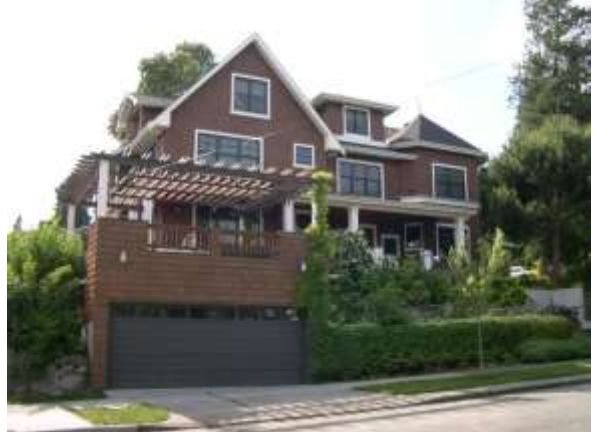
Grade 11/ Year Built 2005/ Total Living Area 7,430 Account Number 881540-0950