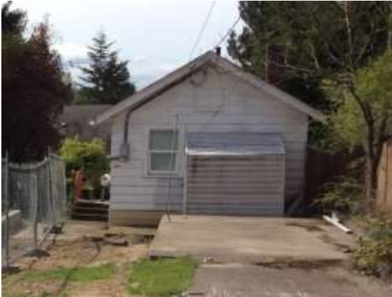
Grade 4/ Year Built 1935/ Total Living Area 350 Account Number 677820-0071