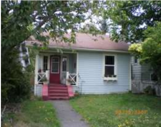
Grade 6/ Year Built 1915/ Total Living Area 610 Account Number 386340-0015