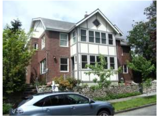
Grade 11/ Year Built 1900, Renovated 2005/ Total Living Area 5,470 Account Number 288320-1125