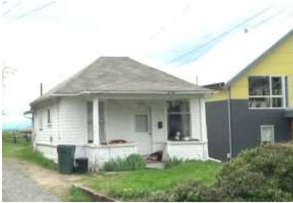
Grade 4/ Year Built 1907/ Total Living Area 560 Account Number 953010-1305