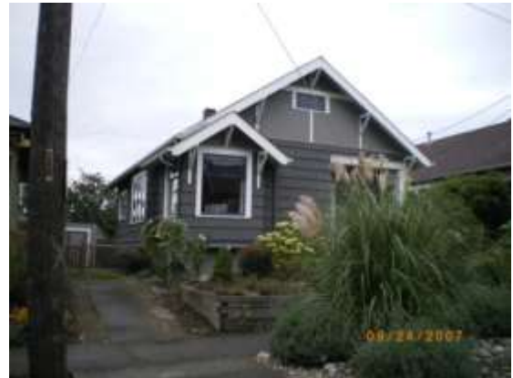
Grade 7/ Year Built 1908/ Total Living Area 960 Account Number 251350-0015