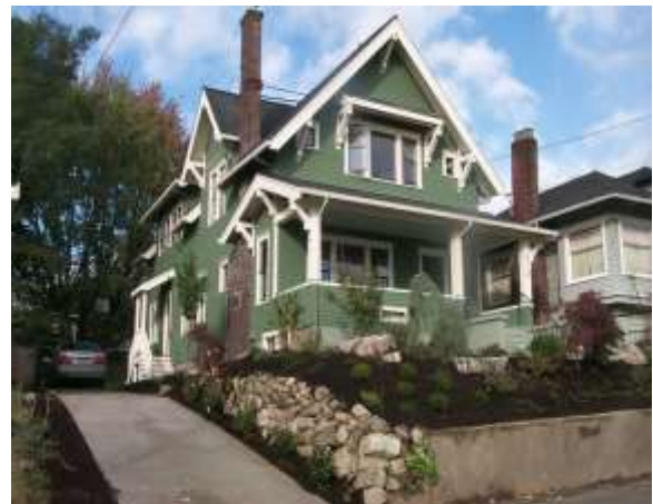
Grade 9/ Year Built 1911/ Total Living Area 3170 Account Number 917860-1075