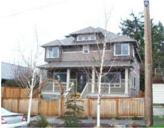
Grade 10/ Year Built 2008/ Total Living Area 3,620 Account Number 953010-1780