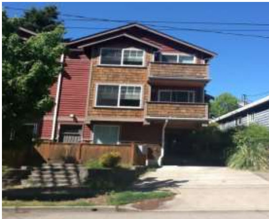
Grade 8/ Year Built 2007/ Total Living Area 1,160 Account Number 132430-0126