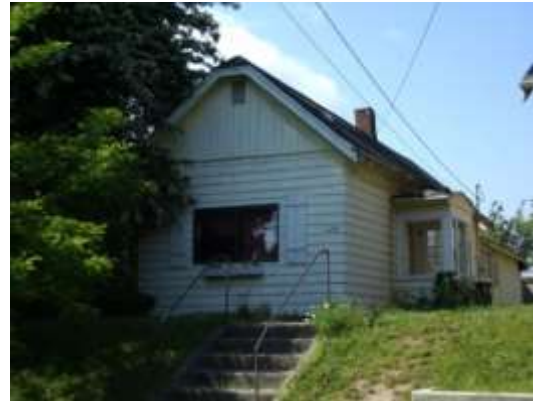
Grade 5/ Year Built 1906/ Total Living Area 870 Account Number 385690-2290