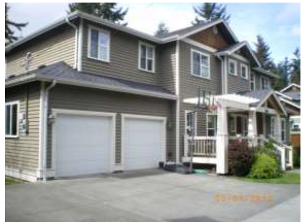
Grade 9/ Year Built 2005/ Total Living Area 2,660 Account Number 303420-0598