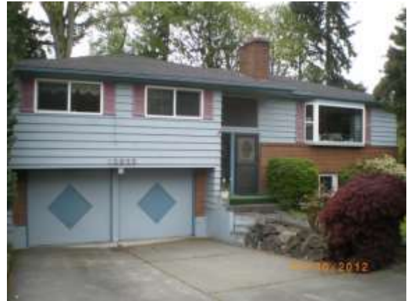
Grade 7/ Year Built 1958/ Total Living Area 1840 Account Number 303420-0882