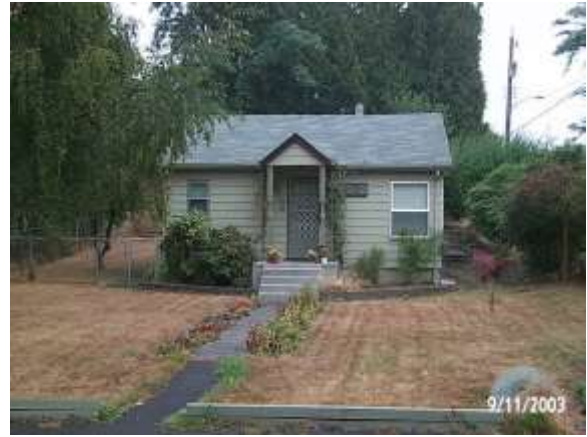
Grade 5/ Year Built 1951/ Total Living Area 740 Account Number 383400-0190