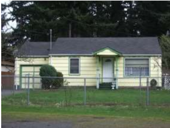
Grade 6/ Year Built 1950/ Total Living Area 990 Account Number 614970-0300