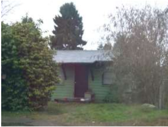
Grade 4/ Year Built 1946/ Total Living Area 450 Account Number 614560-0735