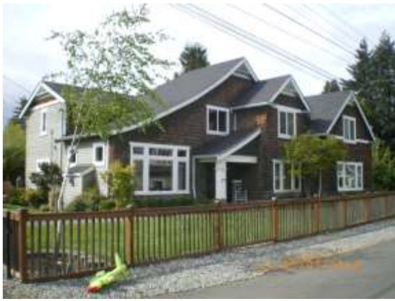
Grade 10/ Year Built 2001/ Total Living Area 3,770 Account Number 303420-0656