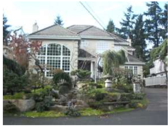
Grade 11/ Year Built 1988/ Total Living Area 3250 Account Number 638150-1920