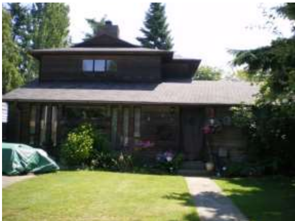
Grade 8/ Year Built 1950 Renov 1986/ Total Living Area 2790f Account Number 615070-0281