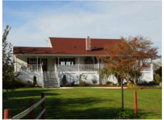
Grade 6/ Year Built 1944/ Total Living Area 1830 Account Number 122606-9032