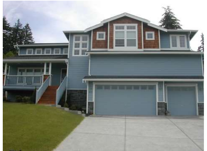
Grade 8/ Year Built 2003/ Total Living Area 3020 Account Number 803535-0070