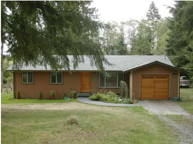
Grade 7/ Year Built 1975/ Total Living Area 1270 Account Number 078270-0090