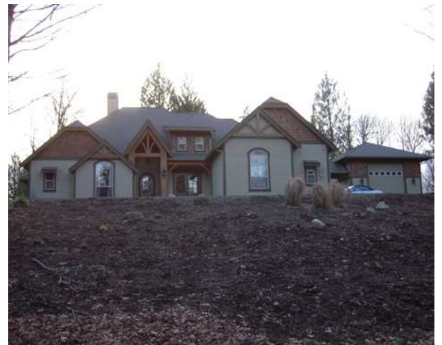
Grade 10/ Year Built 2008/ Total Living Area 3680 Account Number 252606-9099