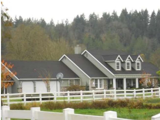
Grade 9/ Year Built 1987/ Total Living Area 3290 Account Number 078270-0090