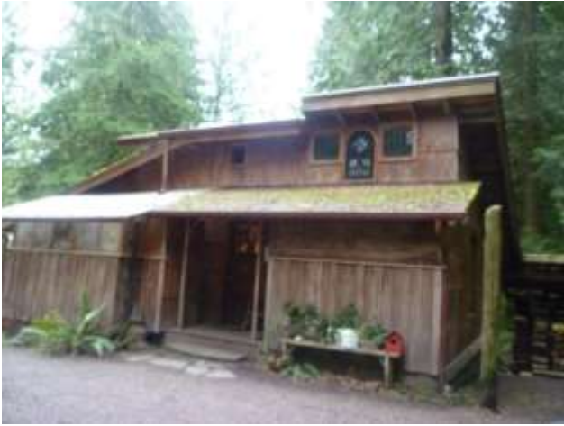
Grade 4/ Year Built 1970/ Total Living Area 1000 Account Number 155000-0140