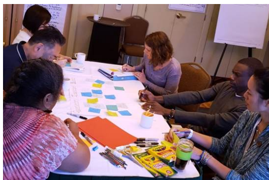
Communities of Opportunity Interim Governance Group members and staff on May 13, 2016

In May, the Communities of Opportunity Interim Governance Group spent two days in SeaTac designing how Communities of Opportunity (COO) will expand and shift over the next five years. Making bold change will involve collective action from many public and private sectors. COO Interim Governance Group members are looking forward to working with many sectors and community partners to test and scale how to turn the curve on today's inequitable health, housing, economic opportunity and community connection indicators.