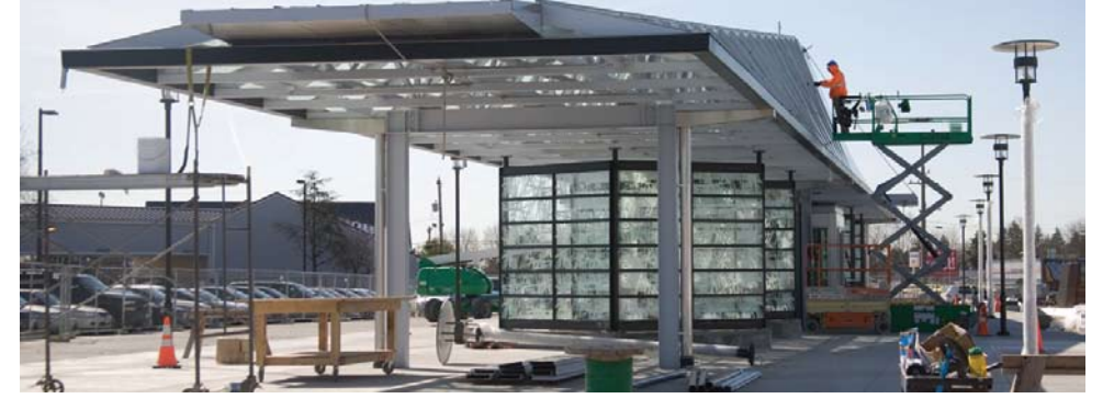
A construction worker at the Burien Transit Center in March, as the center neared completion.

Metro has been serving a steadily increasing number of riders in the South King County subarea . Ridership grew by 30 percent from 2005 to 2008, as shown in the chart below.