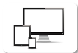
Fig 1. Communication Tools