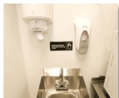
Fig. 2 Handsink with soap and paper towels

Remind customers to stand at least 6 feet apart.