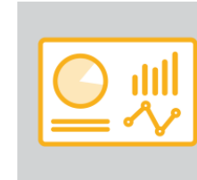
Key indicators of COVID-19 activity

This data dashboard shows total cases, deaths and demographics.