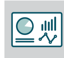
Daily Summary Dashboard

This data dashboard shows total cases, deaths and demographics.