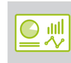
Long Term Care Facility Dashboard

This dashboard shows emergency department visits and hospitalizations for COVID-like illness and pneumonia at King County healthcare facilities.