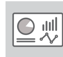
Syndromic Surveillance Dashboard

This dashboard shows the impacts of COVID-19 on communities of color compared to whites in King County, WA.