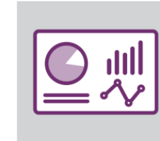
Economic, Social and Overall Health Impacts Dashboard

This dashboard displays data on key indicators that track COVID-19 activity.