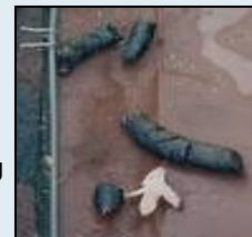
Raccoon droppings are cat-sized & may contain seeds and partially-digested berries.