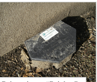
Bait station or "Bait box

Rat poison should always be used in secured bait station to keep it away from children and pets. Only use it according to the directions on the label.