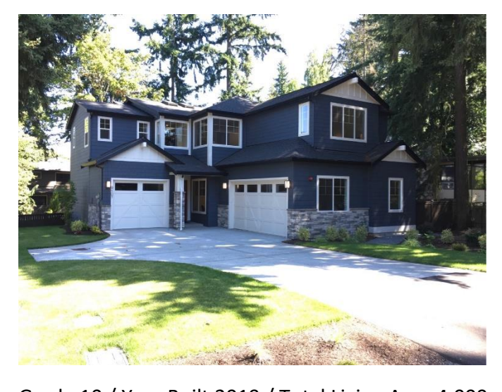
Grade 10 / Year Built 2019 / Total Living Area 4,000