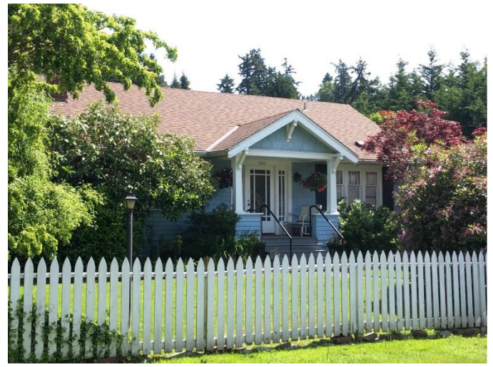
Grade 6 / Year Built 1929 / Total Living Area 910