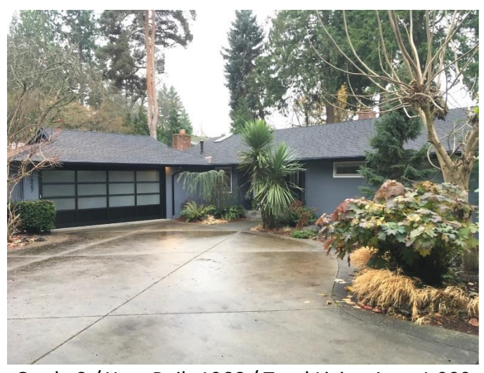
Grade 8 / Year Built 1966 / Total Living Area 1,900