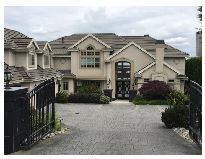
Grade 13 / Year Built 2000 / Total Living Area 7,730