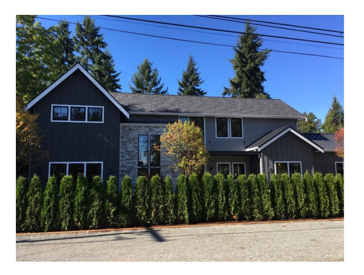
Grade 11 / Year Built 2019 / Total Living Area 4,660