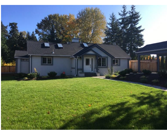
Grade 7 / Year Built 1942 / Total Living Area 1,820