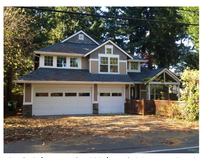
Grade 9 / Year Built 1998 / Total Living Area 2,410