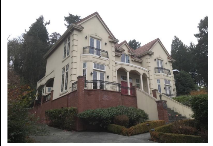
Grade 12 / Year Built 2001 / Total Living Area 7,380