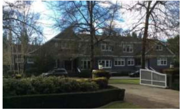
Grade 13/Year Built 1991/Total Living Area 14030