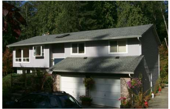
Grade 7/Year Built 1983/Total Living Area 2400