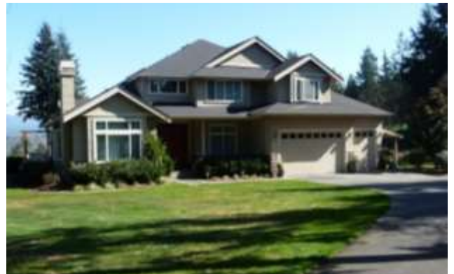
Grade 9/Year Built 2002/Total Living Area 3900