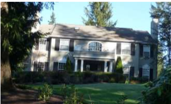
Grade 10/ Year Built 2000/ Total Living Area 3920