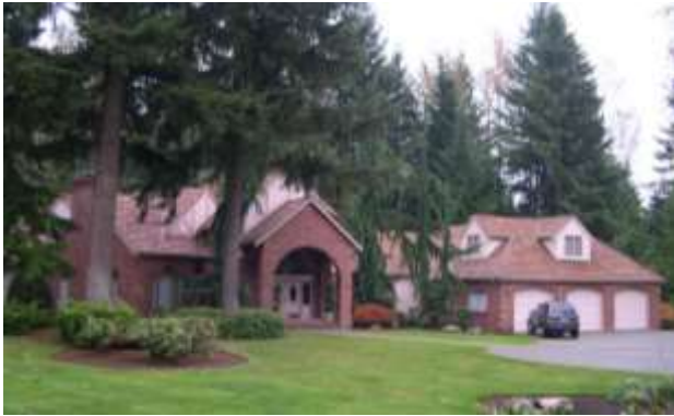
Grade 12/Year Built 1989/Total Living Area 5510