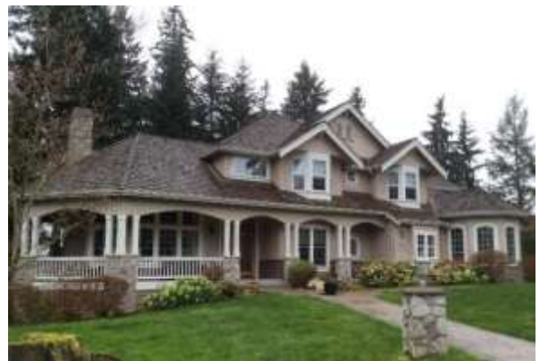
Grade 11/Year Built 2002/Total Living Area 4540