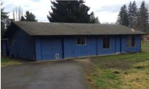
Grade 6/Year Built 1979/Total Living Area 1010