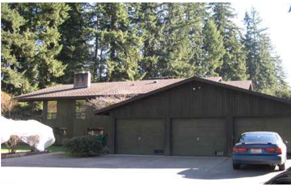
Grade 8/Year Built 1973/Total Living Area 3710