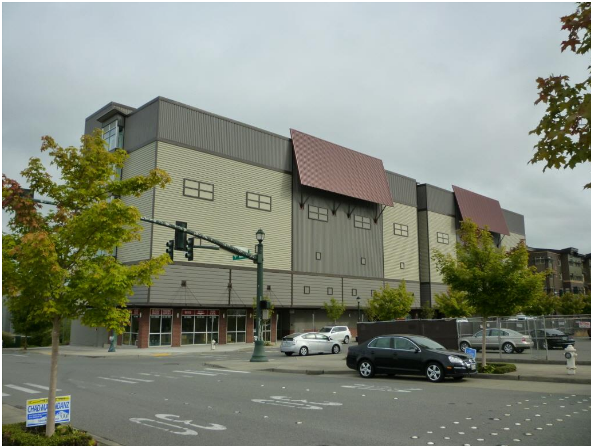
NEW, STATE-OF-THE-ART FACILITY - 910 NE HIGH STREET, ISSAQUAH