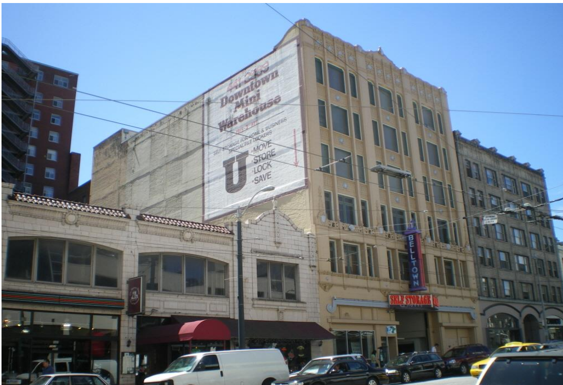
URBAN WAREHOUSE CONVERSION – 1915 3 RD AVE, SEATTLE