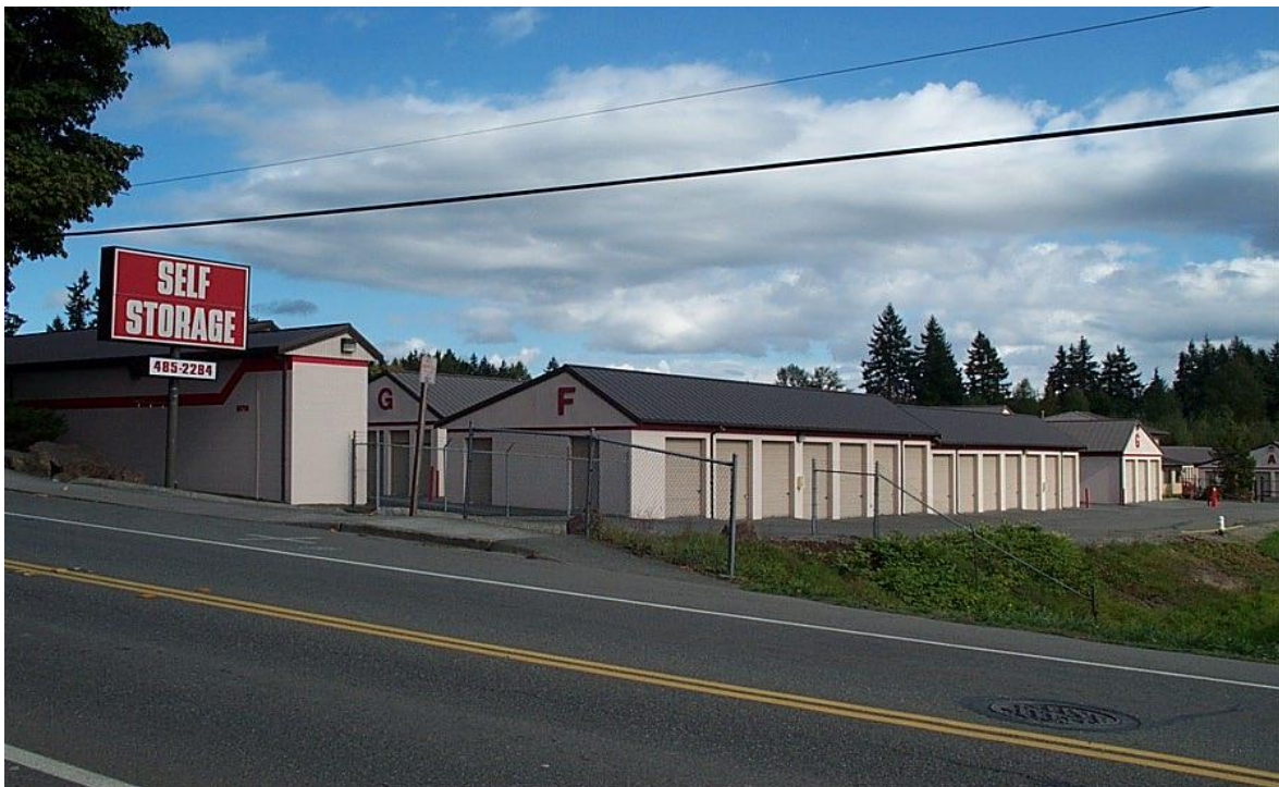
TYPICAL OLDER FACILITY – 18716 68 TH AVE NE, KENMORE