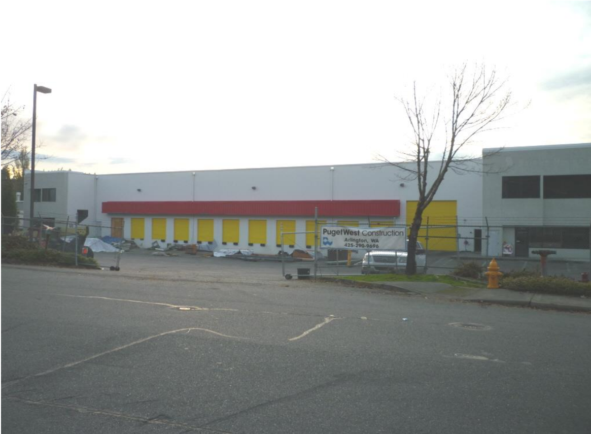
SUBURBAN WAREHOUSE CONVERSION – 7115 132 ND PL. SE, NEWCASTLE