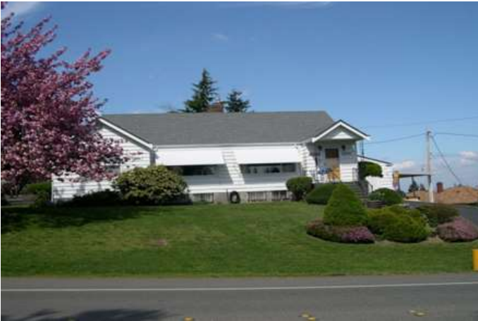
Grade 7/Year Built 1947/Total Living Area 1800 Account Number 004000-1072