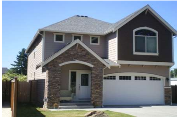
Grade 8/Year Built 2009/Total Living Area 2520 Account Number 017900-1755