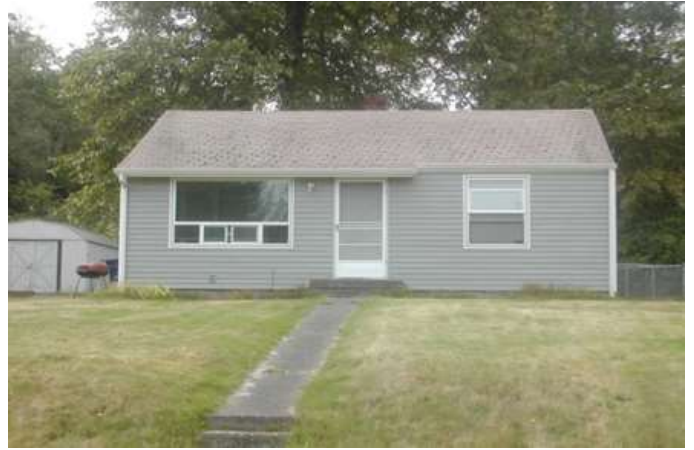
Grade 6/Year Built 1950/Total Living Area 700 Account Number 443600-0071