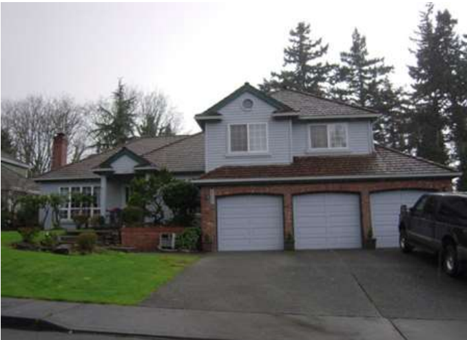
Grade 9/Year Built 1988/Total Living Area 2230 Account Number 512210-0080