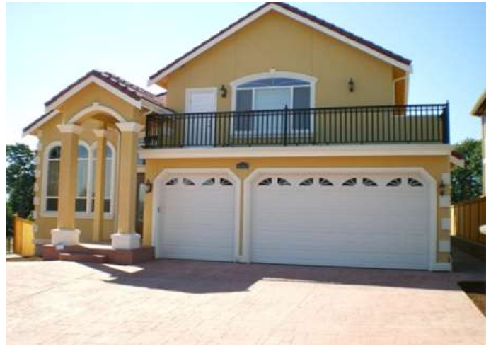
Grade 10/Year Built 2008/ Total Living Area 3720 Account Number 004200-0135