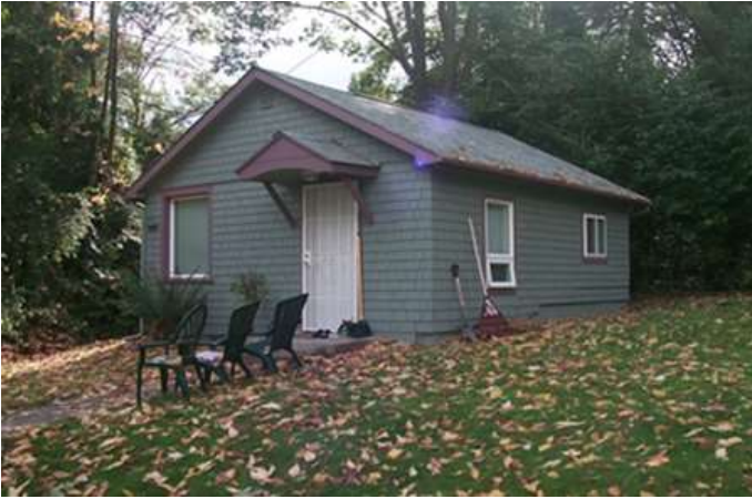
Grade 5/Year Built 1913/Total Living Area 380 Account Number 734560-0917