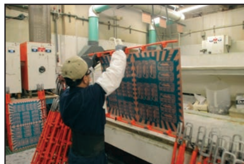
Waste from circuit board manufacturing can contain heavy metals. The largest portion of KCIW program costs is associated with monitoring heavy metals.

Facilities that violate the regulations are required to reimburse King County for the costs associated with the violation. Post-violation fees include the cost of preparing enforcement documents, additional inspections, additional sampling, and analysis. Based on King County Code, the Wastewater Treatment Division seeks to recover the full cost associated with violations from those that violate the rules.