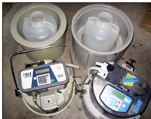
Automatic samplers can collect composite samples according to a time schedule or metered flow.

Representative Sample: A sample that reflects the discharge throughout the sample collection period. Collect samples when your business is discharging waste to the sewer during routine operation. If your business discharges only at certain times of the day, be sure to sample at those times. If your business has no flow to sample, report no discharge. There is no need to create flow just to measure it.