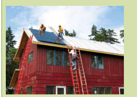
Solar PV system being installed on a metal roof.

There are two main types of PV panels – rigid crystalline panels tend to be more efficient at converting solar energy to electricity; thin film PV is lighter, more flexible and generally cheaper, but less efficient.