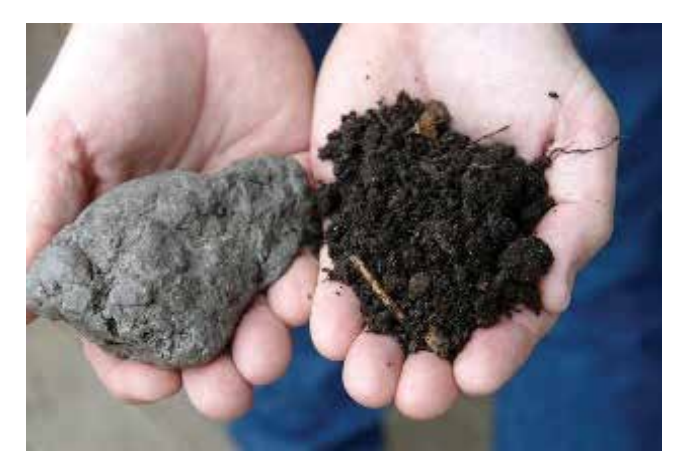
The difference between heavily compacted and healthy amended soil from the same site is very apparent.

Go Further: Implement an 'Integrated Pest Management' (IPM) system for landscaped areas; healthy, biologically active soils help to increase the success of using IPM – see Resources for more information.