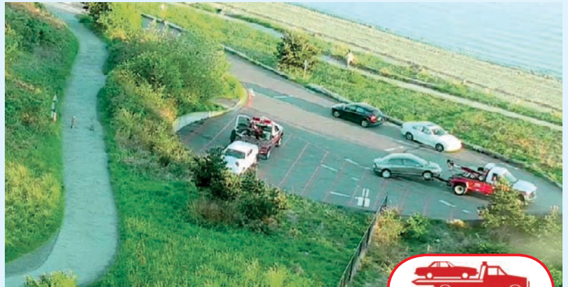
Illegally parked cars being towed.

For more information about Discovery Park/West Point Treatment Plant Security, visit: www.kingcounty.gov/wp-access .