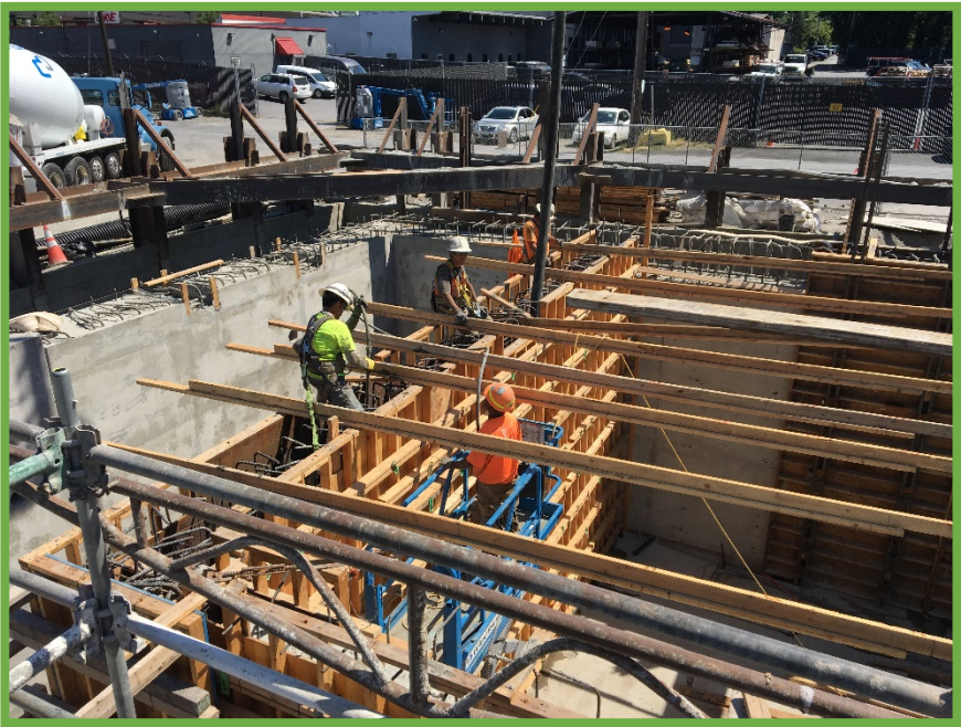
Workers install the forms for the concrete walls of the odor control room.