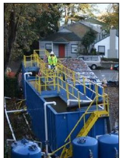
An example of a dewatering equipment.

ALTERNATIVE FORMATS AVAILABLE 206-684-1280 / 711 (TTY Relay)