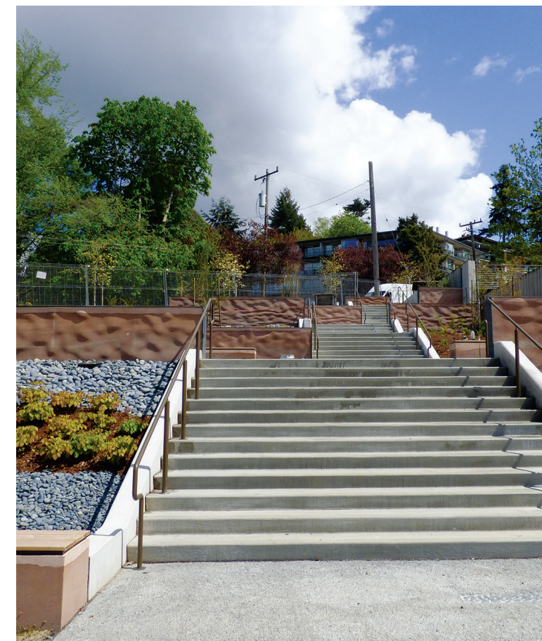
The public staircase is now open!

We would like to thank you for your patience during this three-year construction project. We have greatly appreciated your willingness to navigate construction concerns with us. Please be sure to fill out the customer feedback survey . Your comments will help King County refine its community engagement efforts throughout our region.