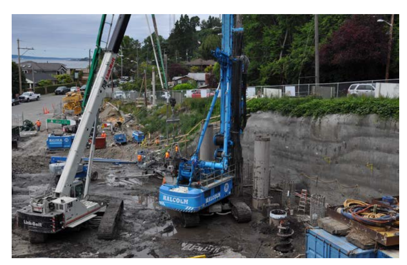
Drilling equipment used to build the storage tank outer wall leaves the work area for good during the week of August 18