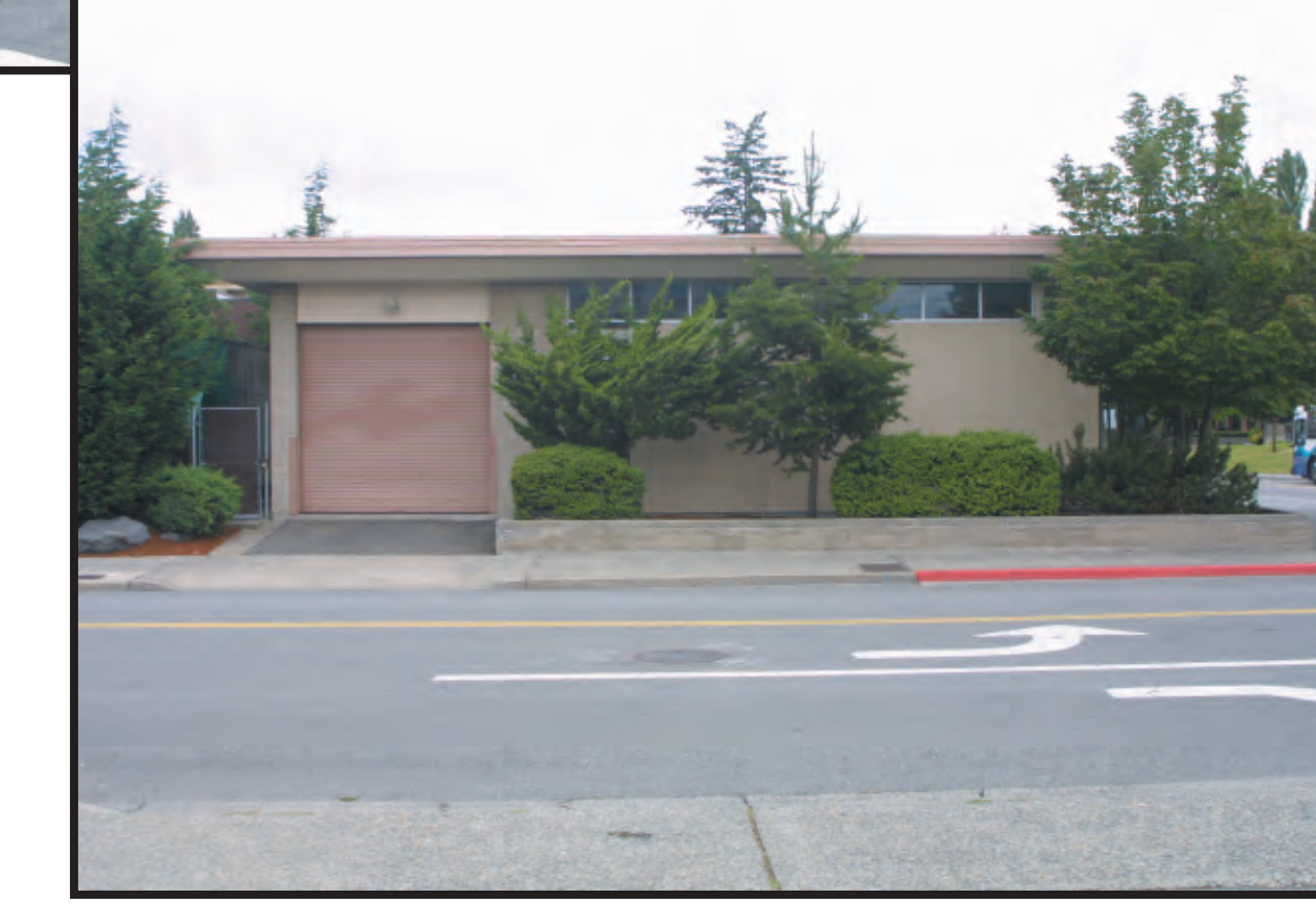
PUMP STATION FROM PARK LANE