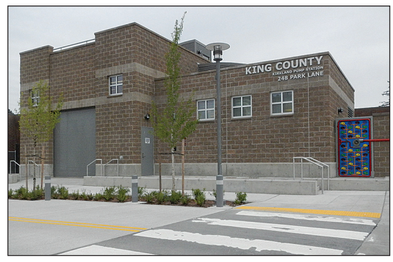
King County's Kirkland Pump Station recently finished ahead of schedule.

Additional information is also available on the project website at <a href="https://www.kingcounty.gov/environment/wtd/Construction/East/Kirkland.aspx">www.kingcounty.gov/environment/wtd/Construction/East/Kirkland.aspx</a>