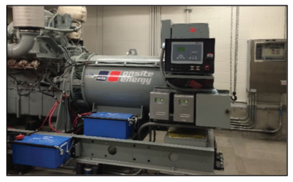
A new generator will ensure the pump station is operational even during storms and power outages.