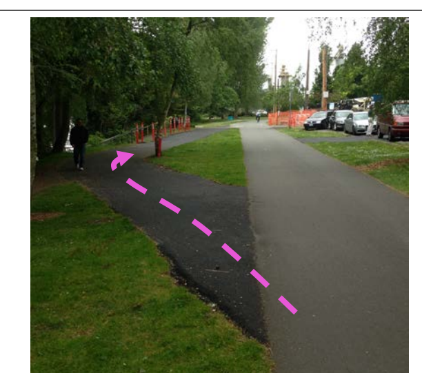
The Burke-Gilman Trail will detour south during work in Fremont Trail Park. Trail users can enter the trail at 3rd Ave NW or 1st Ave NW.

Please avoid the project area and sidewalks on 36th Ave NW next to the project area. Please do not engage individuals working at the site. Community members can ask questions or share concerns about the project 24 hours a day by calling the project information line ( 206-205-5428 ).