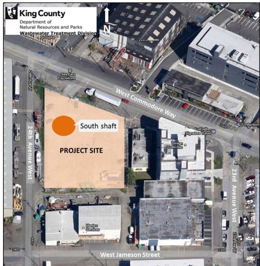
South site project area.

Work will begin to re-line the existing siphon in early 2014. This work requires the north site construction area in Ballard to extend into Shilshole Avenue Northwest in front of the project site between 20th Avenue Northwest and Northwest Dock Place. See reverse for more information.