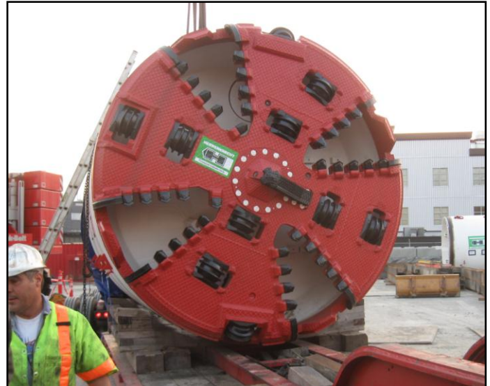
The cutting face of the tunnel boring machine before it was lowered into the south shaft.