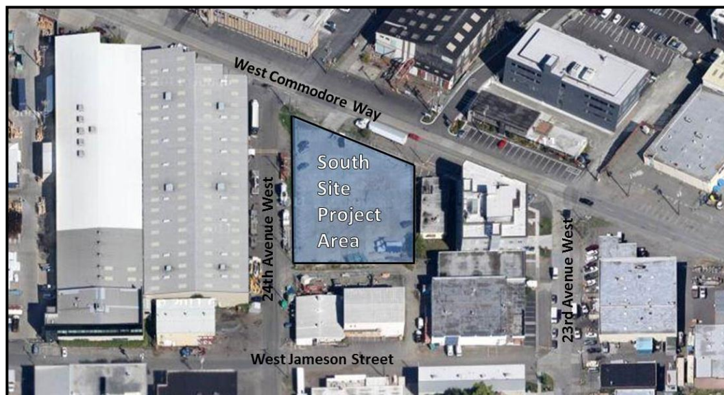
South Site Project Area