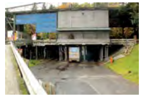
The 50-year-old Algona Transfer Station (above) will be replaced with a modern recycling and transfer facility in south King County.