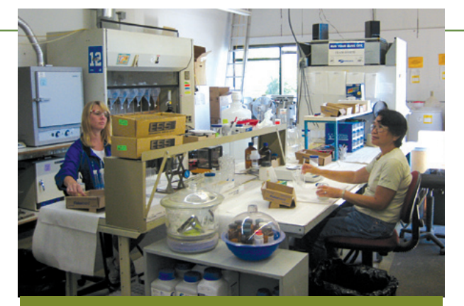
Soil analysis in the lab

• King County also provides Phase I and Phase II Environmental Site Assessment services. King County has a contract with the environmental consulting firm CDM to conduct Phase I