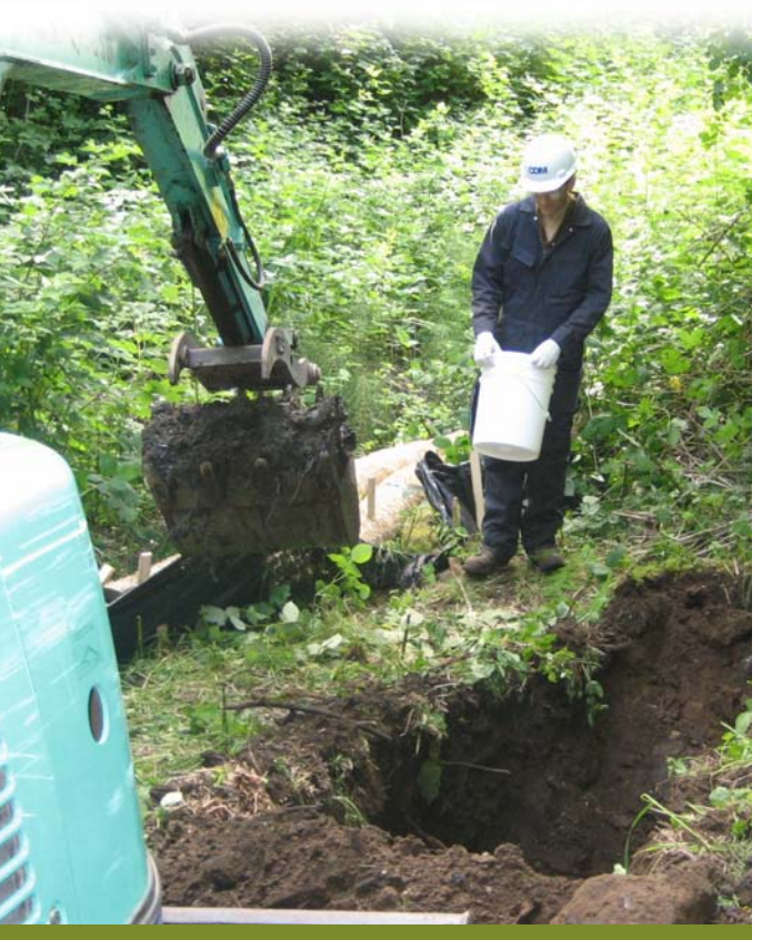
Collecting soil samples at Ellisport Creek on Vashon Island

The King County Brownfields Program provides assistance to qualified private individuals and businesses, nonprofit organizations and municipalities within King County to assess and clean up contaminated sites, also known as Brownfields. Types of assistance include: