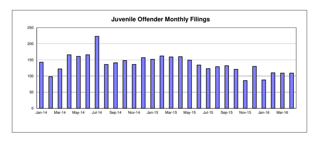
Figure 1. Number of Juvenile Offender Filings, Resolutions and Pending Caseload by Month