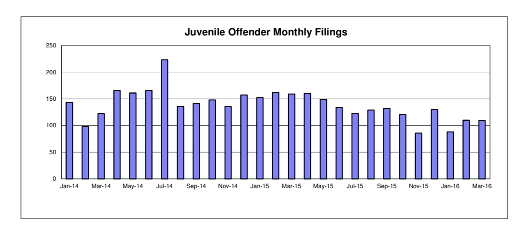
Figure 1. Number of Juvenile Offender Filings, Resolutions and Pending Caseload by Month