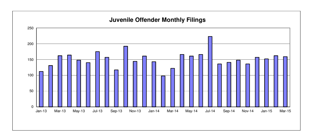
Figure 1. Number of Juvenile Offender Filings, Resolutions and Pending Caseload by Month