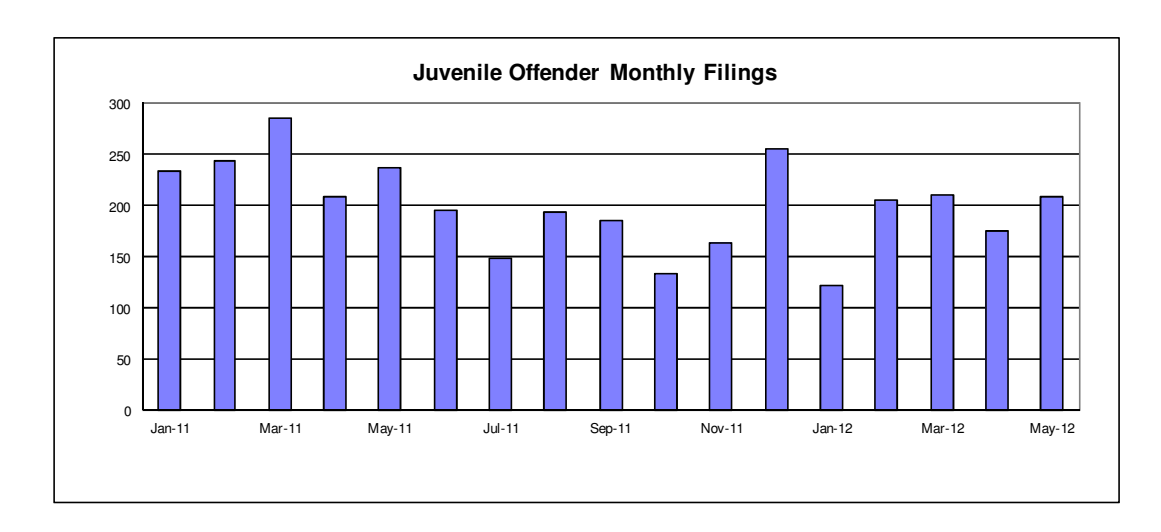
Figure 1. Number of Juvenile Offender Filings, Resolutions and Pending Caseload by Month