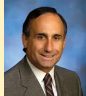
Bellevue Mayor Grant Degginger

Bellevue Mayor Grant Degginger will be welcoming citizens to Bellevue City Hall and the May 10 town hall event.