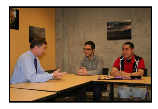
Meeting with students at UW Bothell.