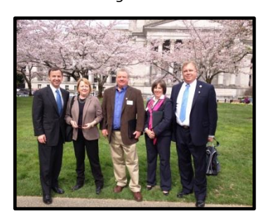
Rod and regional leaders, advocating for a statewide Transportation Package in Olympia.