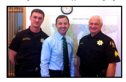
Rod with members of the King County Sheriff Marine Unit.