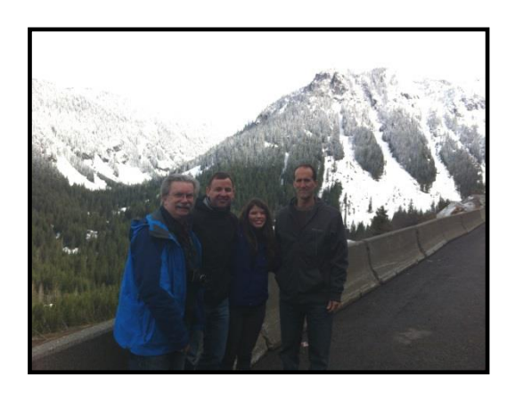
Touring the county's last unprotected old-growth forest.