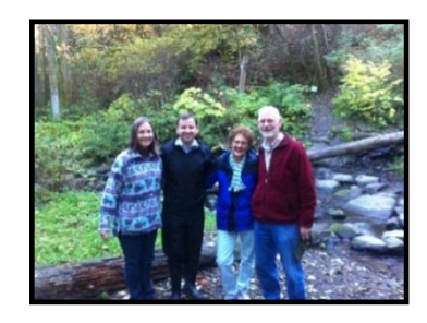
Touring Thornton Creek.