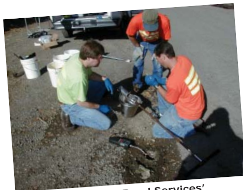
Soil sampling with Road Services' nationally-accredited Materials Lab