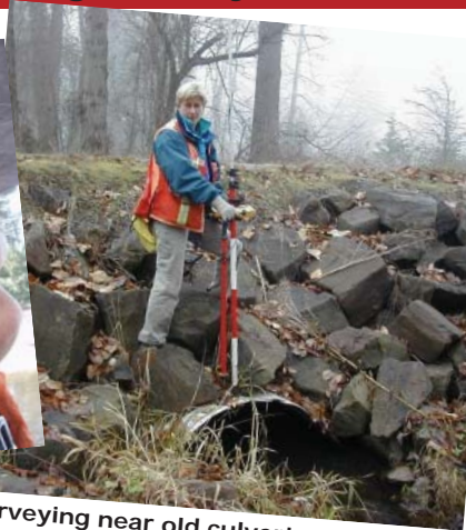
Surveying near old culvert