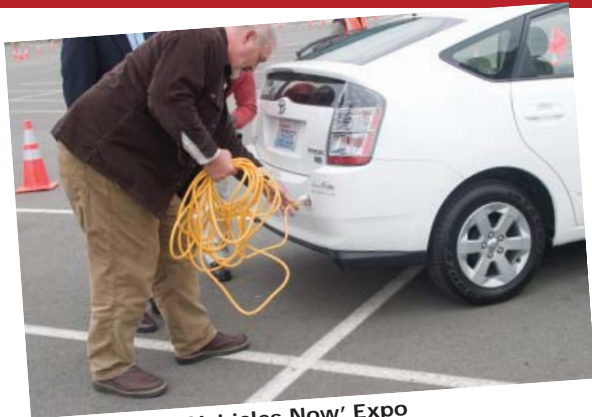
Fleet's 'Clean Vehicles Now' Expo