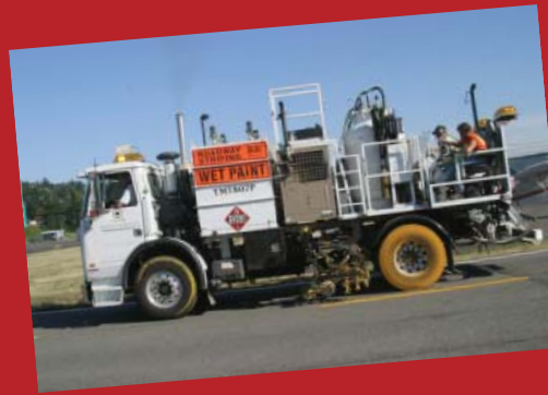
King County offers a unique training experience.