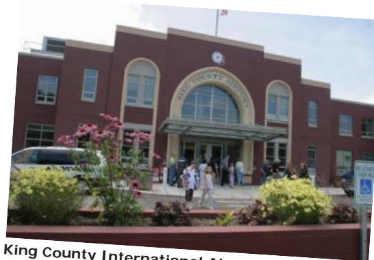
King County International Airport/Boeing Field