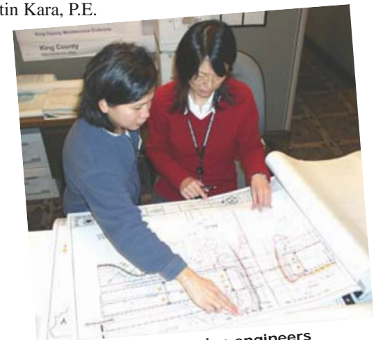
Management and Design engineers reviewing road plans