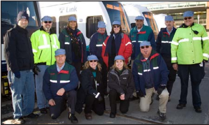
The first graduating class of rail operators and chiefs celebrates by sporting classic rail headgear.

■ Metro rail operators ready to roll —The first five groups of Metro rail operators have completed their training and certification, and a sixth class began training March 9. A total of 59 rail operators will be trained before the start of dry-run (no-passenger) service in May. Between now and then, the new operators will help Kinkisharyo Inc., which built the rail cars, test and “burn in” the cars along the rail alignment from S Royal Brougham Way to the Tukwila International Boulevard Station.