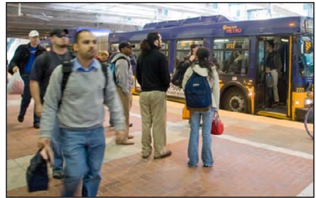
Monthly boardings topped 10 million six times last year.

Other ridership records broken in 2008 include Metro Vanpools,