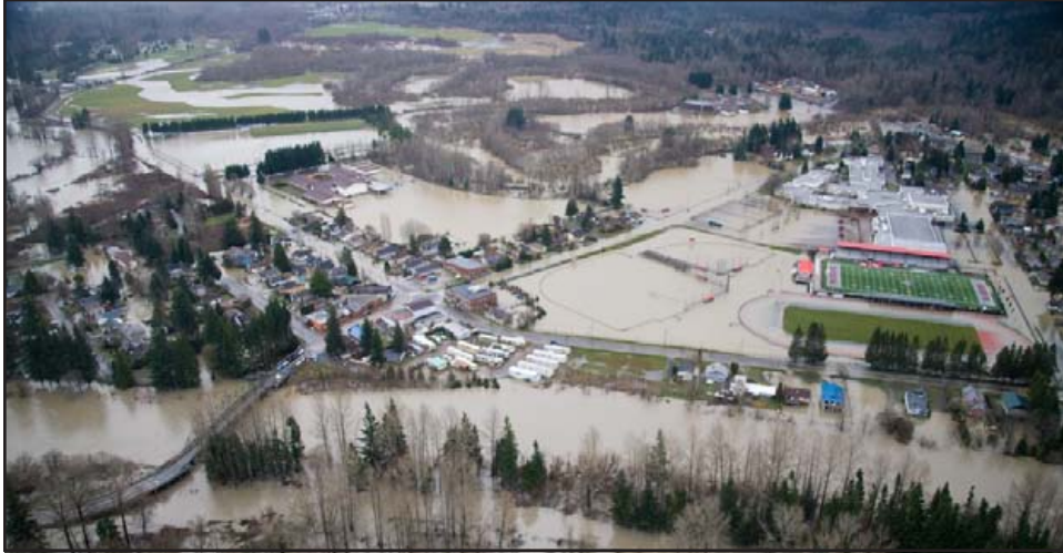
Metro vehicles helped in the evacuation effort during January flooding.