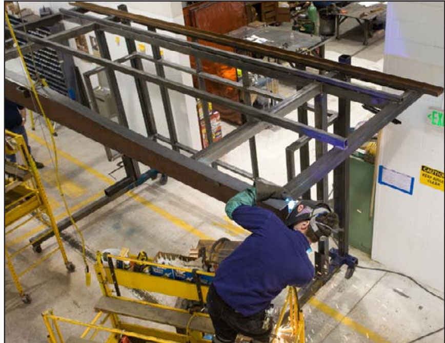
Troy Jaeger, Facilities Constructor, welds a corner of the roof frame for the prototype RapidRide shelter.

Located at the South Facilities Shop near South Base, the Building Systems and Maintenance group is responsible for skilled facilities maintenance projects and includes journey-level welders, plumbers, carpenters, painters, and building operating engineers. "We are all quite pleased with the prototype," said