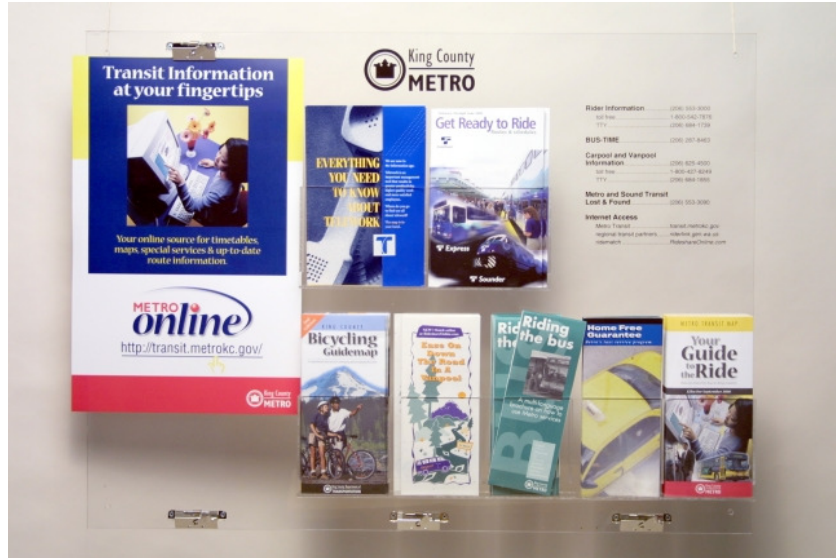
Commute Information Board - $97