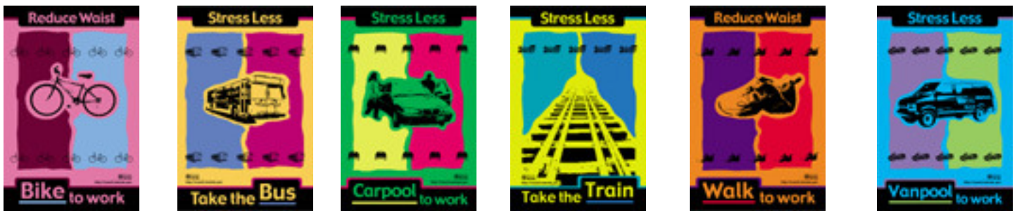
Stress Less poster sets - 1 st set free additional sets $15