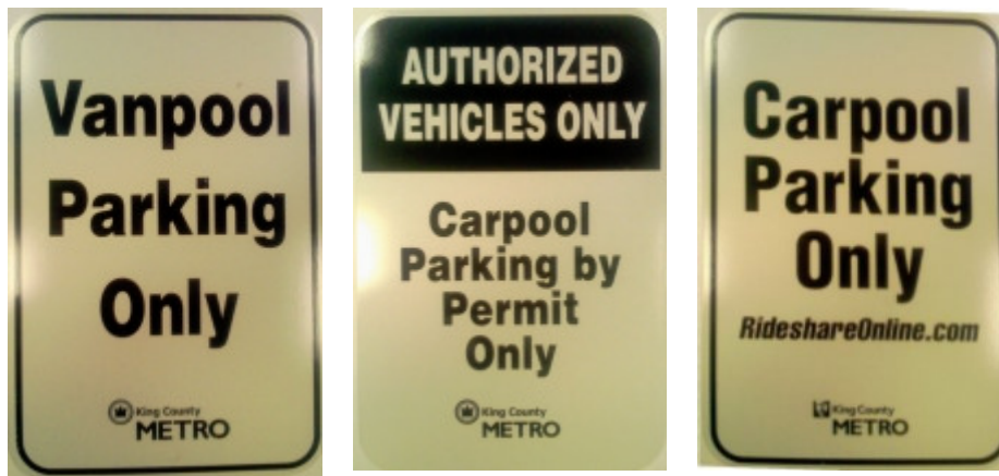
Carpool & Vanpool parking signs and permit tags