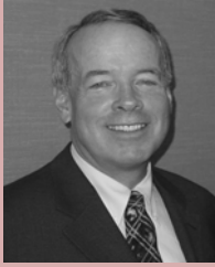
King County Superior Court Presiding Judge Bruce Hilyer