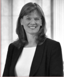
King County District Court Presiding Judge Barbara Linde