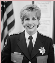
King County Sheriff Sue Rahr