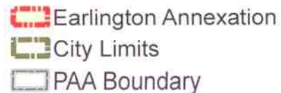
Exhibit F1: Proposed Annexation Boundary

File Name: H:\CED\Planning\GIS\GIS_projects\annexations\earlington_annex\mxd\F1_proposed_annex_bdry.mxd