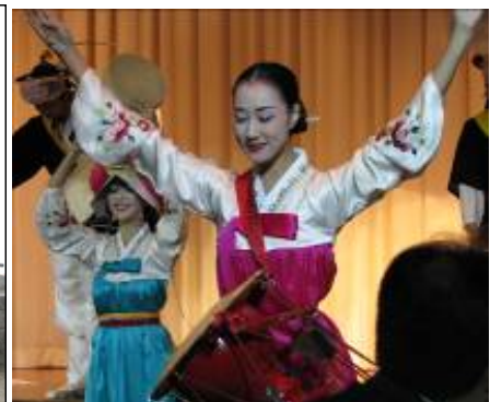
Traditional Korean drumming